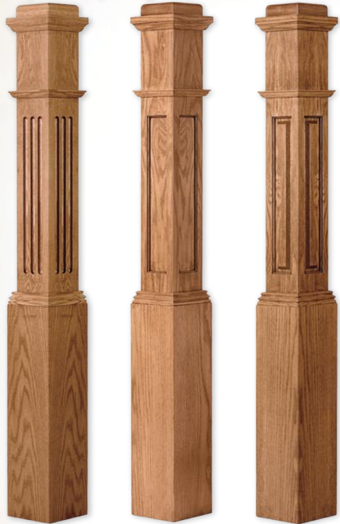
LJ-4091 Fluted Panel

We are now offering our traditional LJ-4091 box newels with decorative fluted panels, recessed panels and raised panels designed to correspond with other millwork in the home. These styles are available in oak, beech, poplar, maple, cherry and gloss primed.