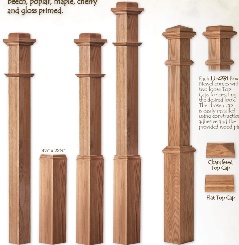
LJ-4075-50 Box Newel (a shorter version of our 66" LJ-4075)

The following new box newels are crafted in the same manner as our traditional LJ-4075 Box Newels. Their solid construction allows for various installation methods. These new items are available in oak, beech, poplar, maple, cherry and gloss primed.